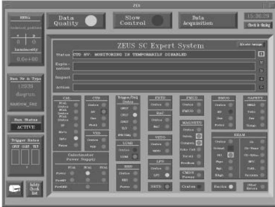
Figure 2: The ZEX Slow-Control display.

to changes in the run conditions, and preparing ZEX to handle short-term conditions in the ZEUS environment.